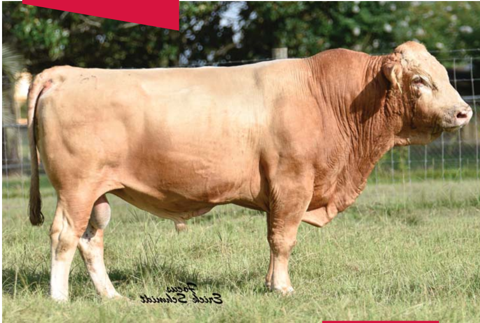
HeartBrand Samsung S0947P