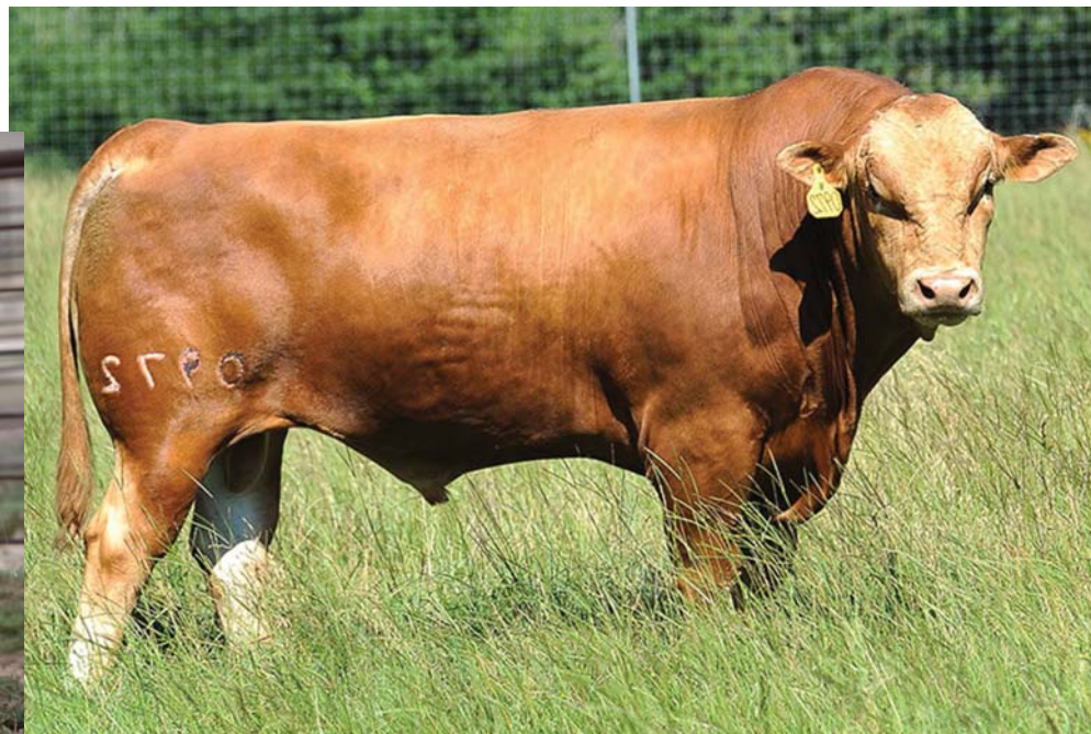
Beeman Ranch 0972B, son of Come and Take It