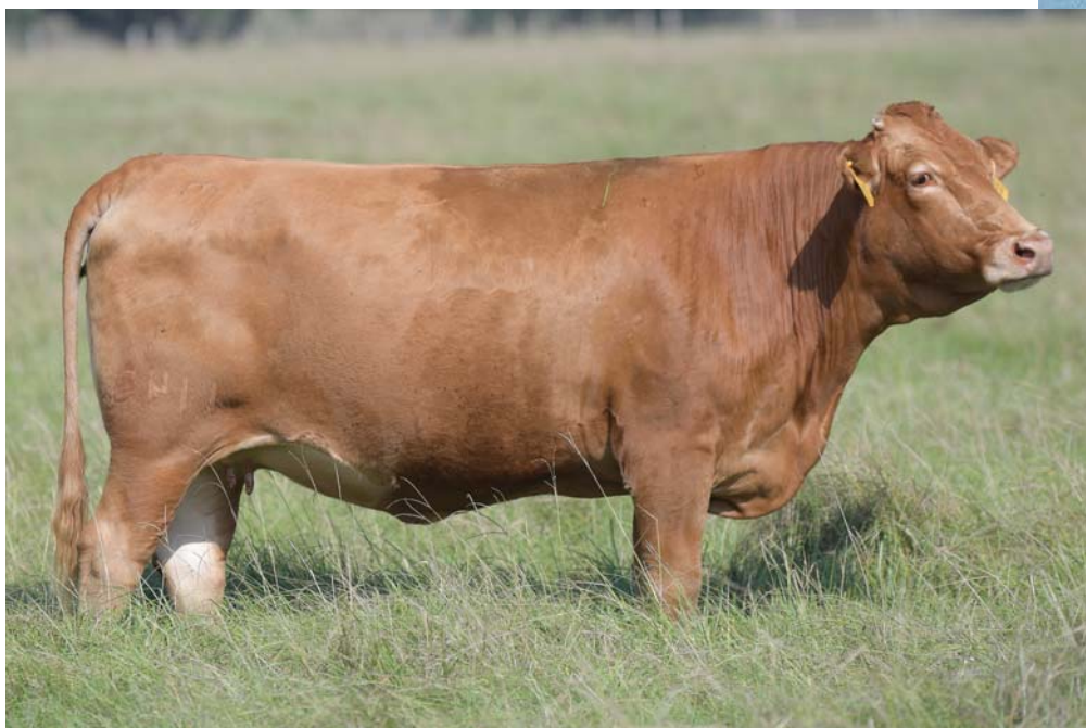
HeartBrand Naomi 1145Z