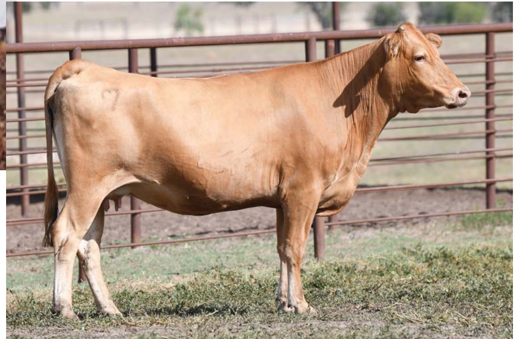
HeartBrand 1400F ET

RUEMEI H39 SIRE: RUESHAW 430 FB2 KIKUTAMA 14285 BIG AL DAM: HEARTBRAND 1400F ET DAI-KYU 9 KOBAI 73