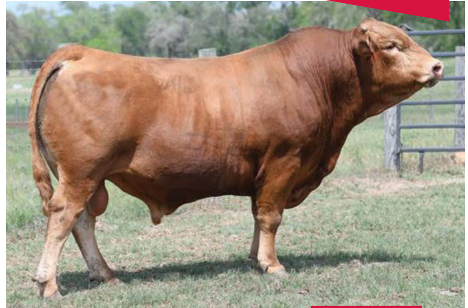
HeartBrand Smooth Criminal PH 64419