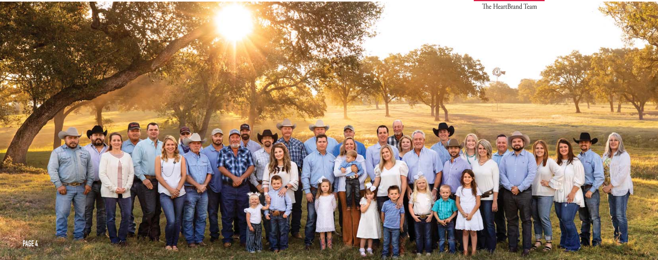
The HeartBrand Team