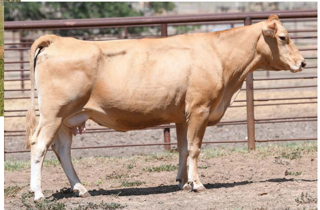
Beeman Ranch 470Z

SIRE: BIG AL AKIKO COME AND TAKE IT DAM: BEEMAN RANCH 470Z HEARTBRAND S4553S