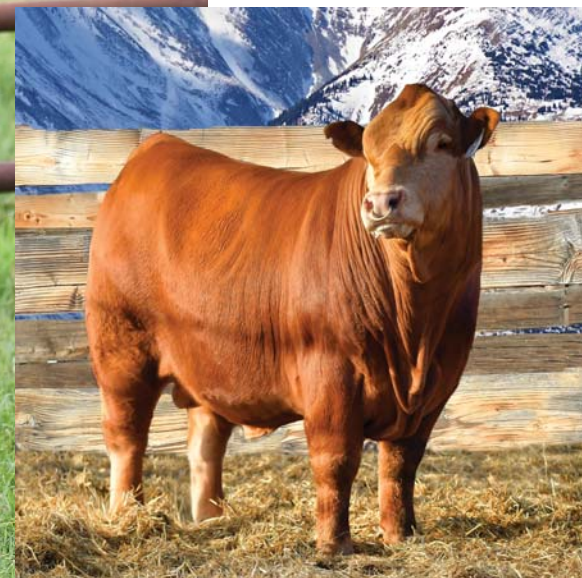
HeartBrand King David