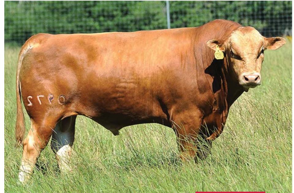
Beeman Ranch 0972B, son of Come and Take It